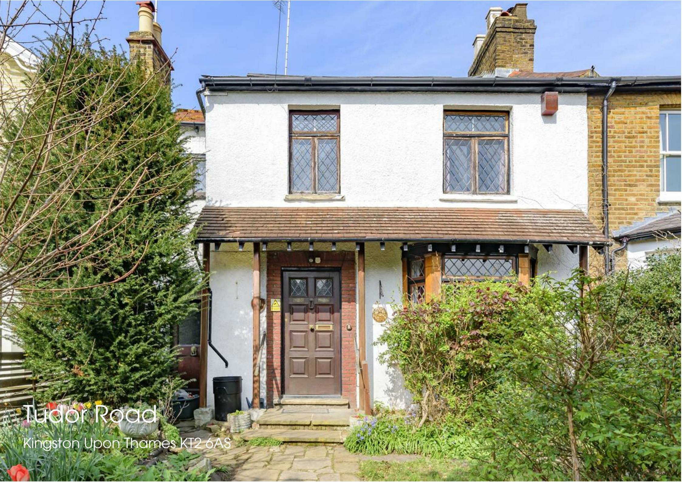
Tudor Road Kingston upon Thames KT2 6AS